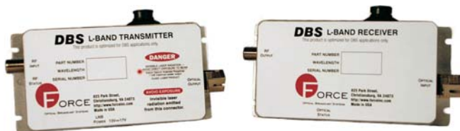
Model 2990PRO: Stand-alone Receiver and Transmitter